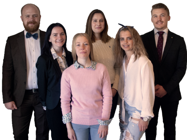
The Student Union Board 2019/2020 and the manager of the Student Union House Origo 2019